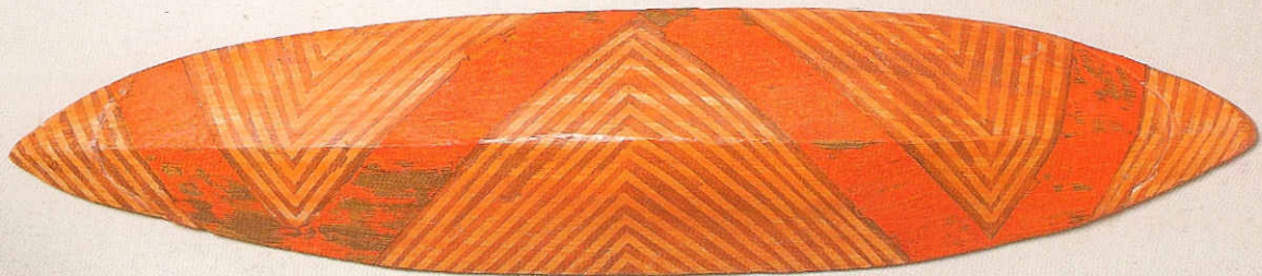
Wall Pod 32"L