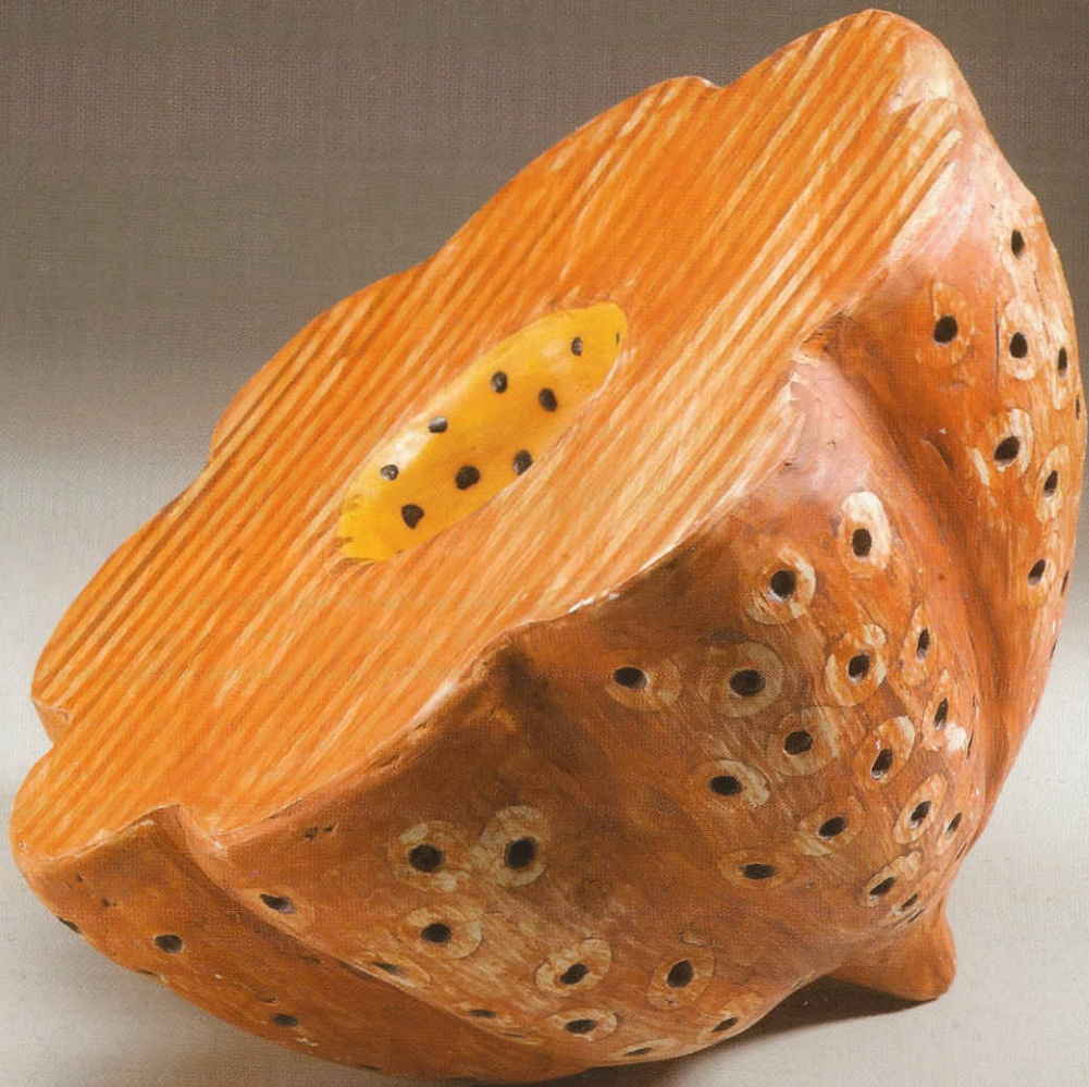
Flower Pod 12" H 14" W