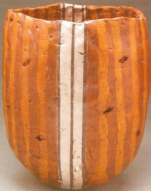
Orange and Red Bowl 14"H 10"W