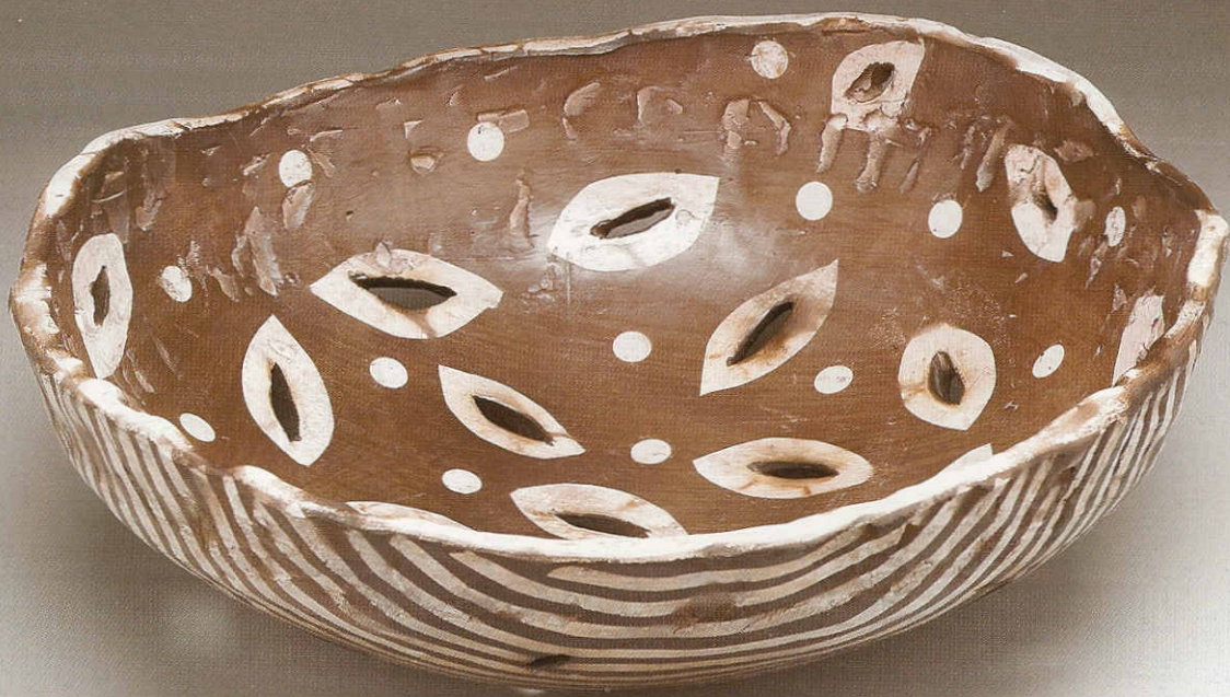
"Eye am" Bowl 16"W 6"H