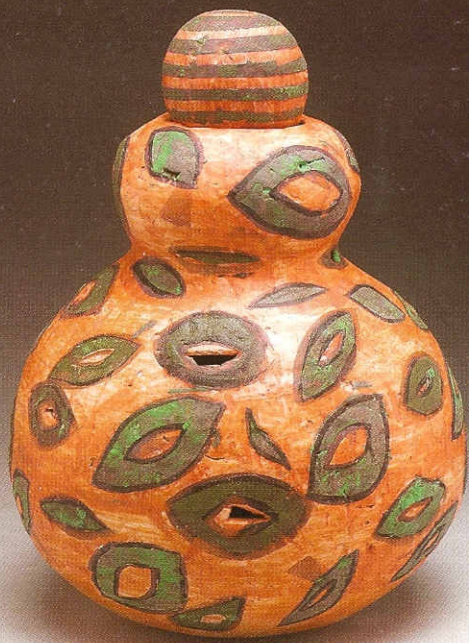
Orange and Green Lidded Form 13"H 9"W