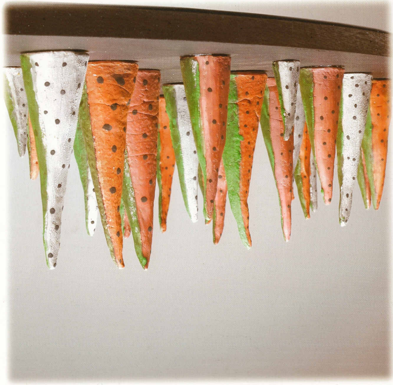
"The Grass is Always Greener...." 24"L 17"W 8"H