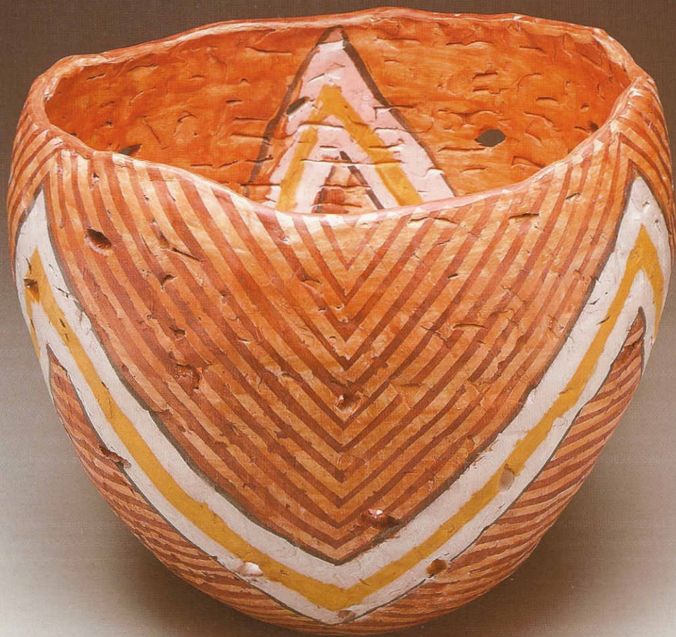
Orange and Yellow Zig-zag Bowl 12"H 12"W