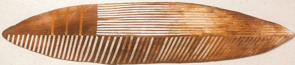
Wall Pod 32"L