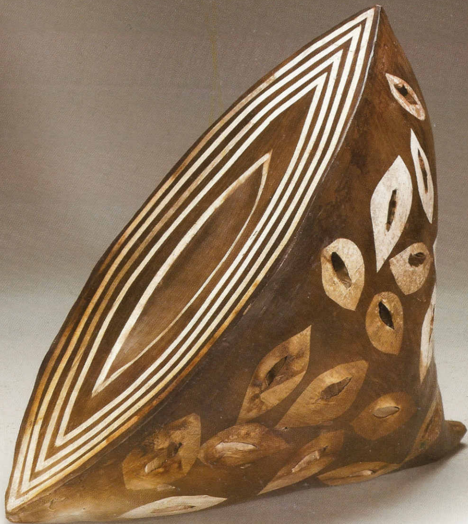
Eye Pod 13"H 14"L